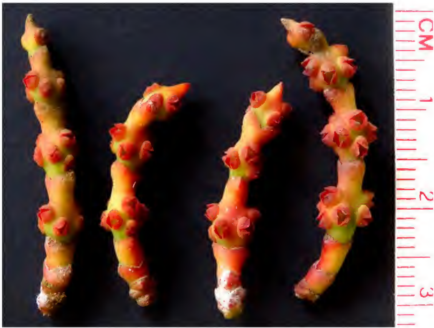
Fig. 2. Dendrophthora primaria , female inflorescences. Harrison & Harrison 638 (UCH).